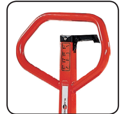
Ergonomic handle ensures the user a relaxed hold. The handle can be marked with the name/department.

Available with manual and electric lifting.