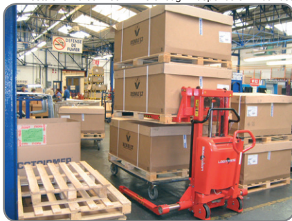
Strong construction ensures a long operating life and low maintenance costs.