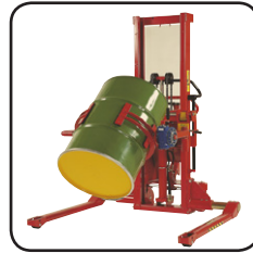
Available with side-tilting forks and/or optional extras, e.g. drum turner, remote control, level control, crane arm.