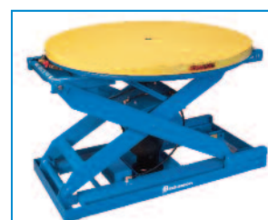
Solid rotating top