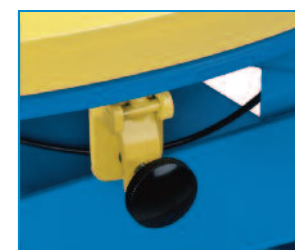
Brake prevents rotator ring from turning