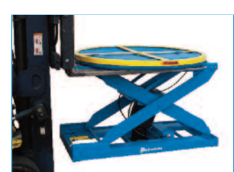
Easily moved with a fork truck