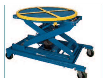
Cart portability with 2 swivel and 2 fixed caster wheels