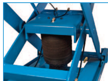
Unique Patent-Pending, Self-Contained Pneumatic System Offers Unsurpassed Performance