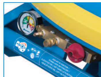
EZ-Adjust Knob Provides Up To 1200 lbs Of Capacity Adjustment With the Turn of a Knob