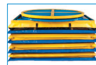
Accordion bellows skirting