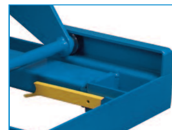
Rollers Are Entrapped In The Base Frame And Platform For Added Stability

The Bishamon EZ-Loader Complies With All Machinery Directive 2006/42/EC Safety Requirements - And Is CE Approved!