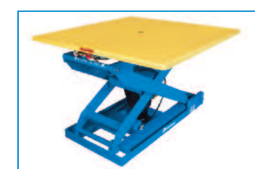
Oversize rotating platform