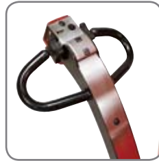
Possible to operate with the handle upright. Central location of all control buttons.