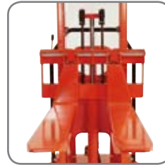
Adjustable forks are available as optional extra in many different lengths and types.