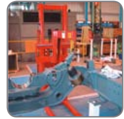
Available with Rotator and/or optional extras, e.g. crane arm, drum turner, remote control, level control, built-in charger.

Strong construction ensures a long operating life and low maintenance costs.