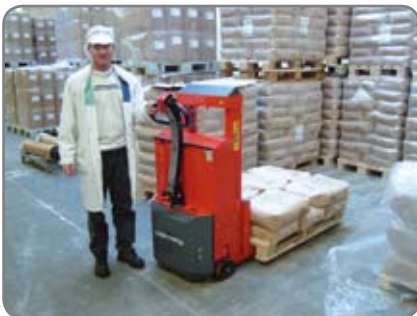
Optimum safety through transparent and impact-resistant safety screen and reduced driving speed in raised position.